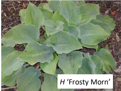
H 'Frosty Morn'