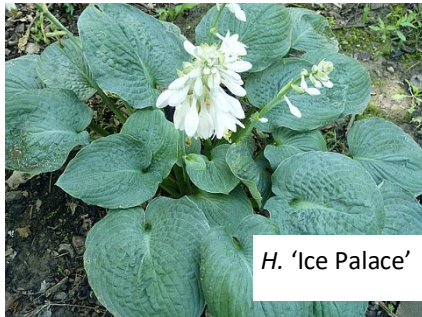
H . 'Ice Palace'