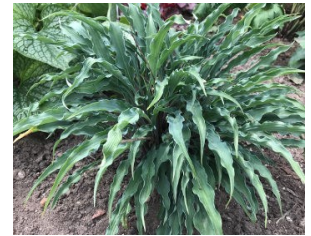
H. 'Silly String' - The AHS gift plant for the 2021 Virtual Convention.