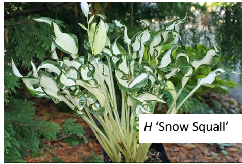
H 'Snow Squall'