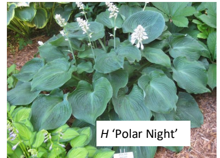
H 'Polar Night'