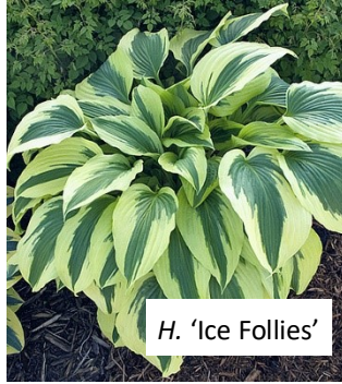
H . 'Ice Follies'