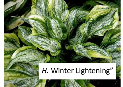
H . Winter Lightening"