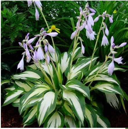
H. 'Night Before Christmas'