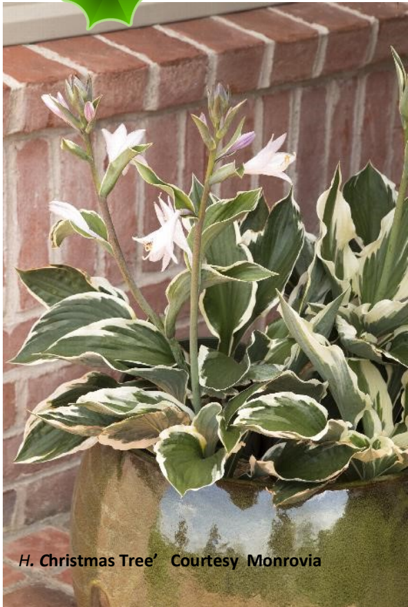
H. 'Christmas Tree'