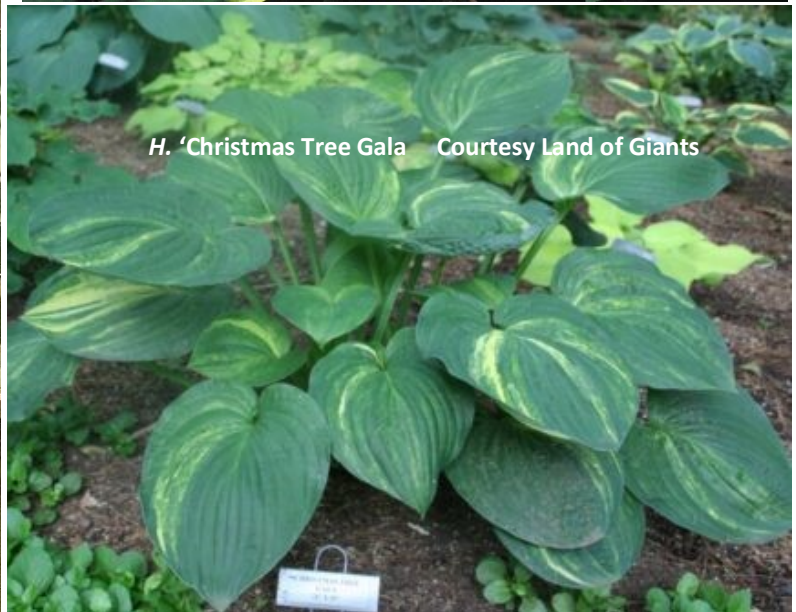
H. 'Christmas Tree Gala'