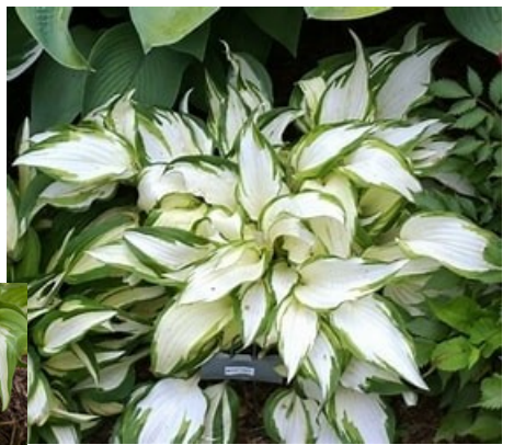
H. 'White Christmas'