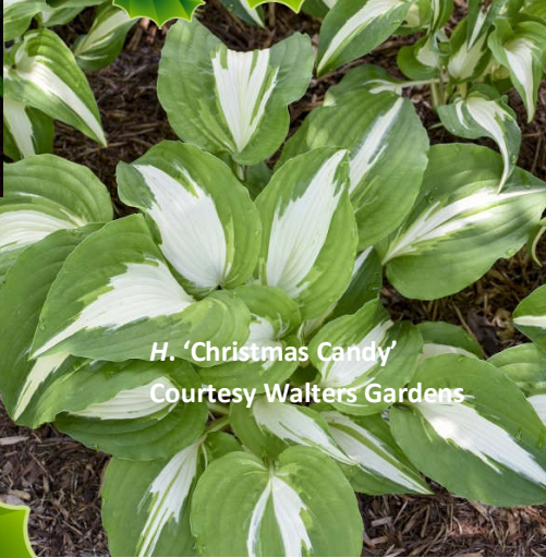
H. 'Christmas Candy'