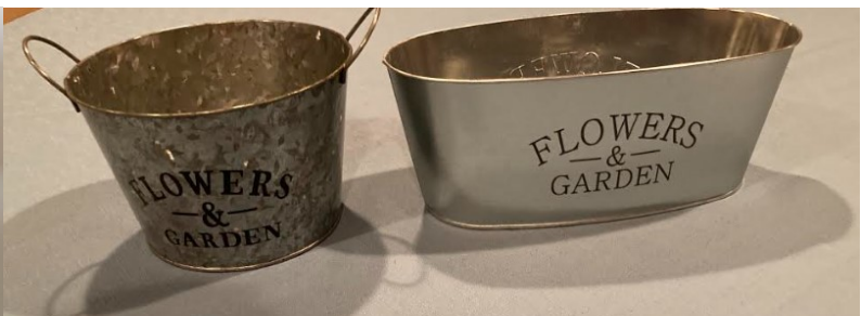
Round: 6.5 dia x 4.25 deep Oval: 10.25 x 4.75 wide x 3.75 deep