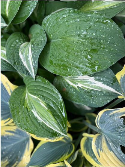
A mosaic from Myra Wallis' garden