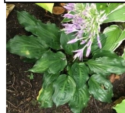
H. 'Lakeside Looking Glass'