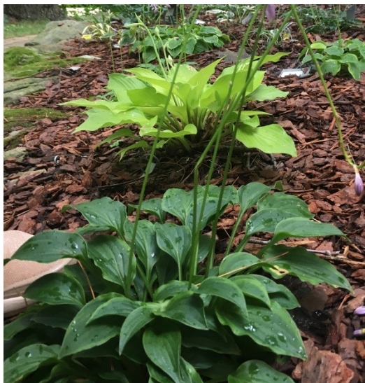
Hosta 'Lemon Delight' and Hosta 'Lemon Zest'