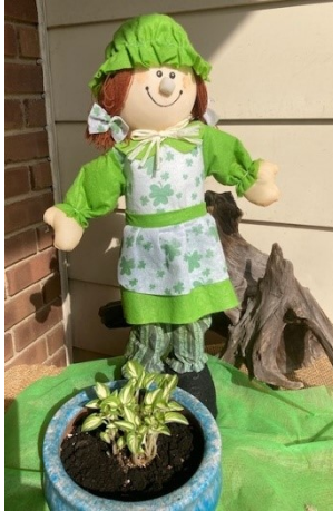
H. 'Pandora's Box'