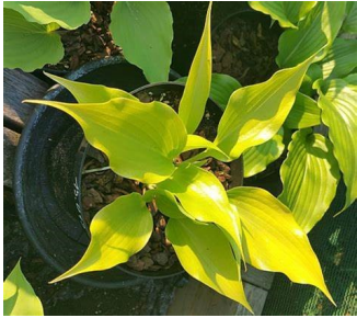
Hosta ‘Citric Star’

Bibliography: “Citrus”. Wikipedia Annals of Botany 11:563-583