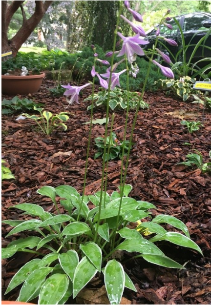
H. ‘Lemon Frost’