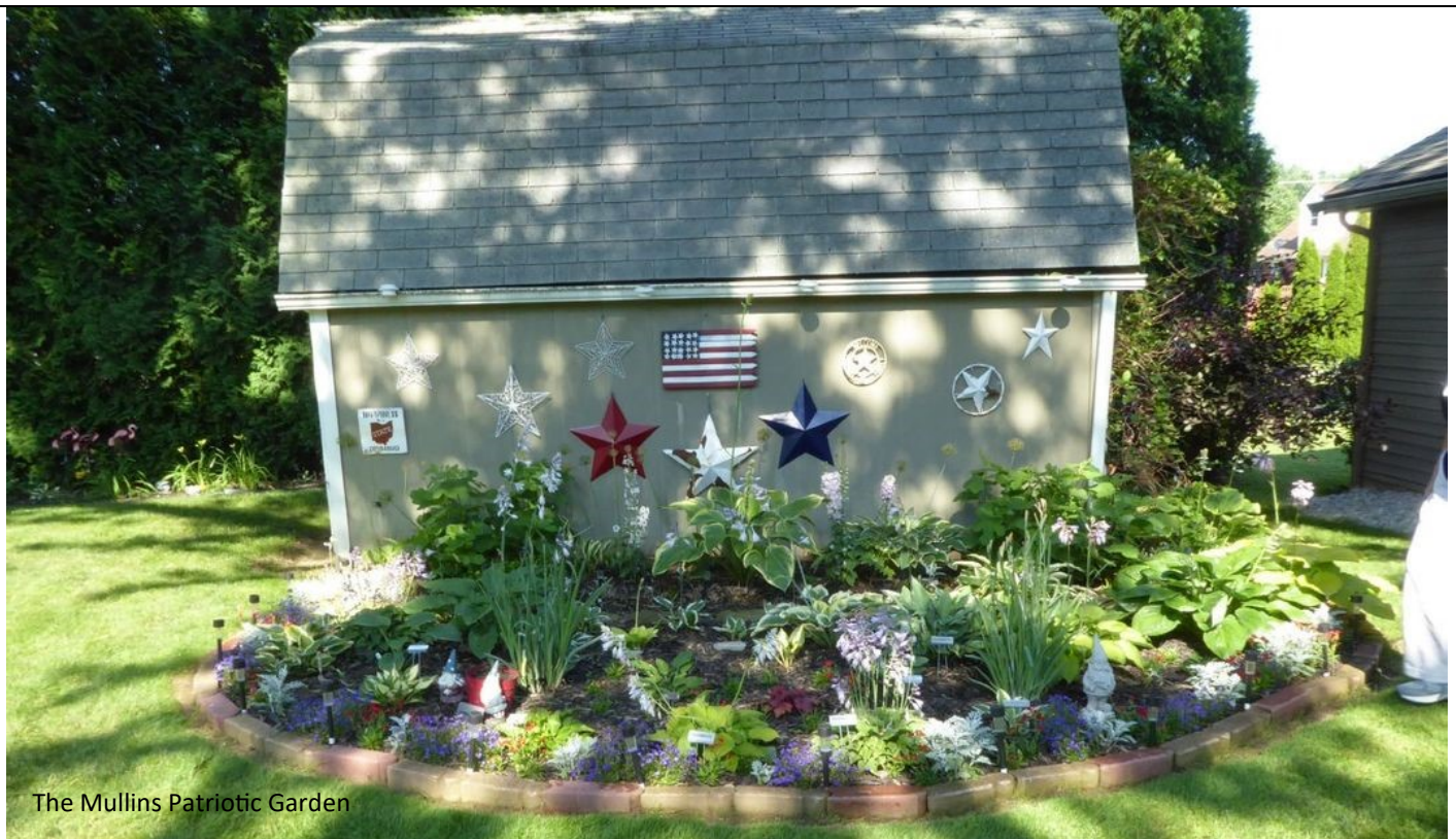
The Mullins Patriotic Garden